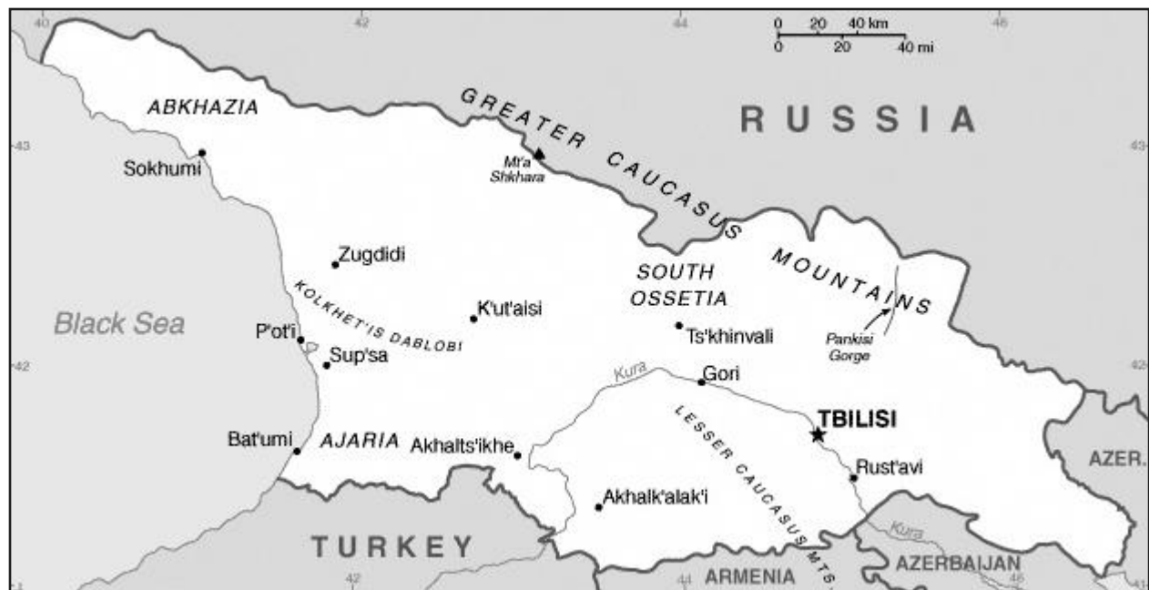
Figure 2: Map of Georgia

Gelati Monastery served as the center for the transmission of Orthodox three-voiced chant in West Georgia, a tradition that was already in serious decline in the late nineteenth century due to the Russification of the Georgian Orthodox Church since 1810. 7 Kutaisi had also been the home of many religious and ethnic minorities including Georgian Jews, Catholics, Megrelians, Svans, Laz, and other peoples, even while under the control of the Ottoman Empire for several centuries. Paliashvili came from a Catholic family, and as an organist and singer in his parish he was exposed not only to the rich Georgian culture in Kutaisi but also to the works of Palestrina, Bach, Mozart, and others.